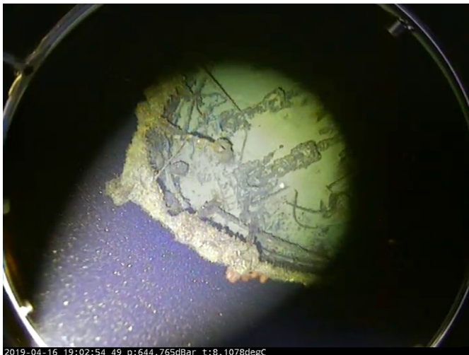
A drop camera view of the bow of SS Iron Crown with anchor chains.

It's not just the opportunity to finally do an in-depth review of the collected footage stored on an external hard drive and shoved in my backpack, but to take the important step of ensuring how the story is told going forward.