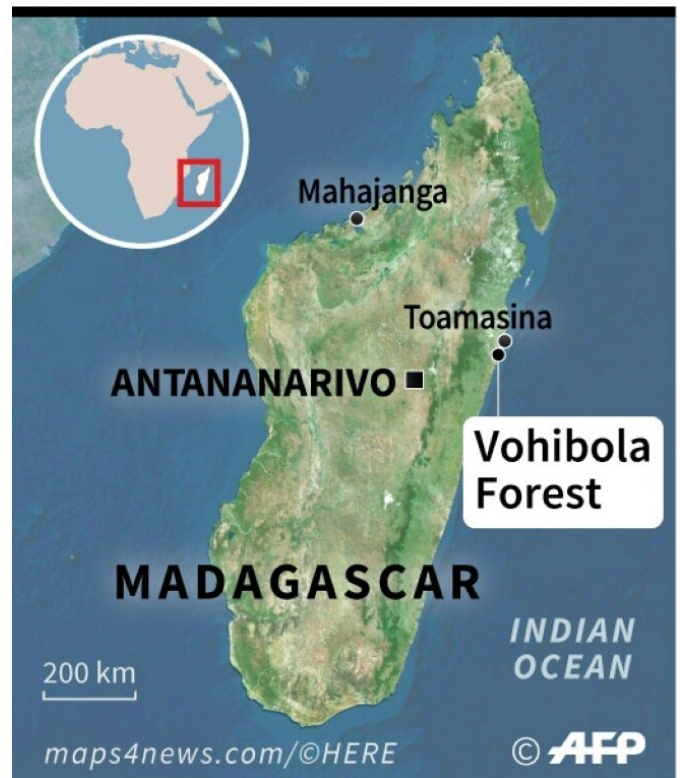
Map of Madagascar locating the Vohibola Forest.

From its head to the tip of its tail, this nocturnal animal (genus Microcebus ) measures under 27 centimetres (11 inches), making it the world's