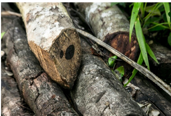
The patrol found freshly-cut ebony trees—a protected hardwood that is being illegally felled and then burned to make charcoal

The state is trying to boost awareness of the dangers of such trafficking, urging people for instance to check the source of their cooking charcoal and encouraging villages to report illegal charcoal and encouraging villages to report illegal logging to the authorities.