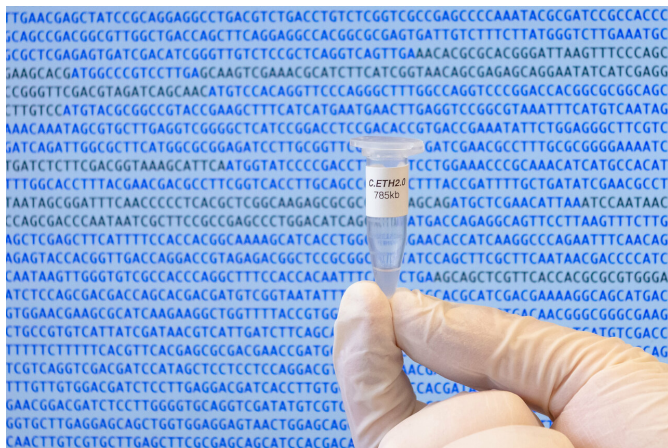
The Caulobacter ethensis -2.0 genome in a micro tube.

The algorithm developed by the scientists at ETH Zurich makes optimal use of this redundancy of the genetic code. Using this algorithm, the researchers computed the ideal DNA sequence for the synthesis and construction of the genome, which they ultimately utilised for their work.