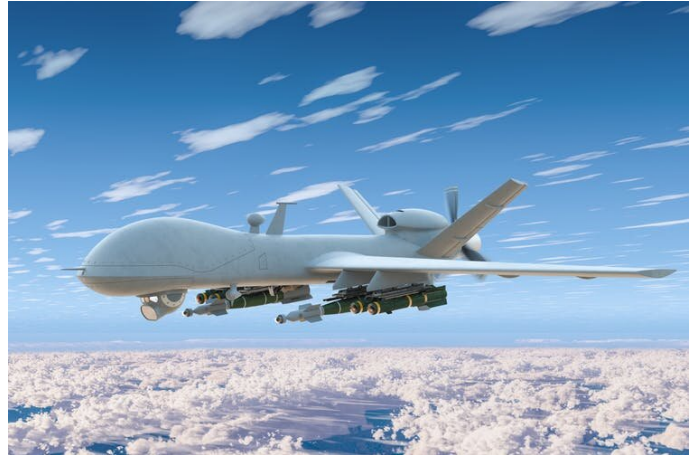
A modern military drone.

In this way, their task is not so much to make a human decision, but rather to do the job that they are employed to do. If the computer tells them to kill, is there really any reason why they shouldn't?