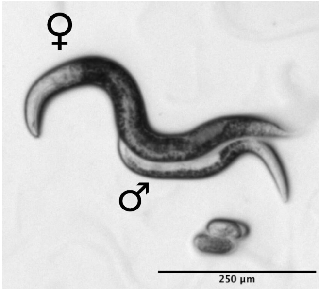
Two specimens of Mesorhabditis belari nematodes

sons, making M. belari a unique case in which males make no genetic contribution, and can instead be seen as a simple extension of females by helping them initiate the development of their eggs.