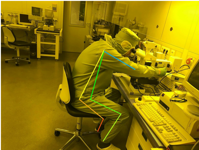
Recognition of the postures of humans using AI-based image analysis.

operations are represented in the data models and may be enhanced to include predictive maintenance. This facilitates agile development of new services and business models and their flexible adaptation to rapidly changing customer needs.