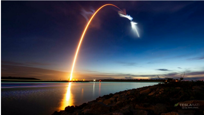
Time lapse image of the ECOSTRESS launch to the International Space Station, June 29, 2018, NASA Kennedy Space Center, Cape Canaveral, FL.

Farmers irrigating their crops may soon be getting some help from space. In 2018, scientists launched ECOSTRESS, a new instrument now attached to the International Space Station. Its mission: to gather data on how plants use water across the world.