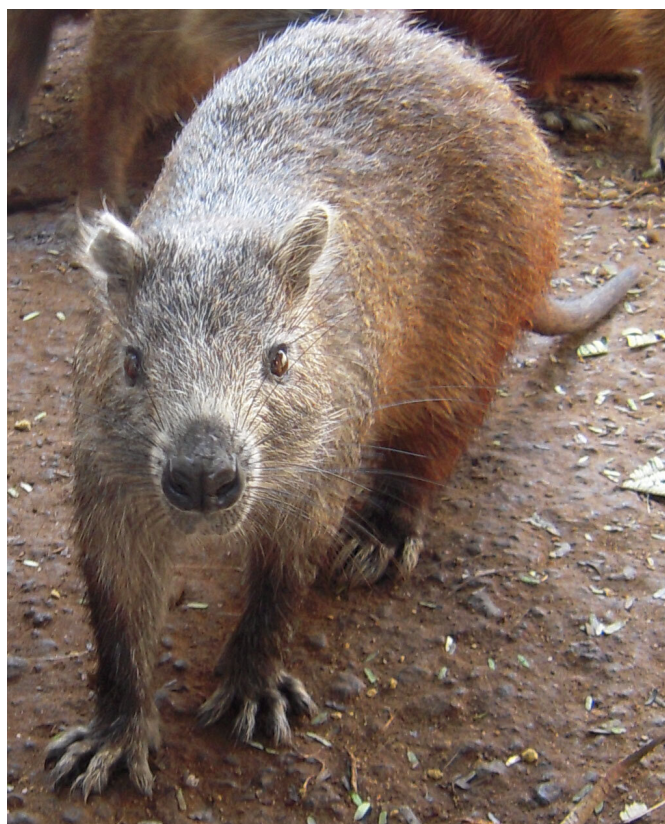
Cuban hutia Capromys pilorides , closest living relative to the newly described mammals.

Published in the Bulletin of the American Museum of Natural History today (March 4, 2019), the team describe two new large rodents ( Capromys pilorides lewisi and Geocapromys caymanensis ), as well as a small shrew-like mammal named Nesophontes hemicingulus . Fossil remains of the land mammal have been previously reported from the Cayman Islands, but have not been scientifically described until now.