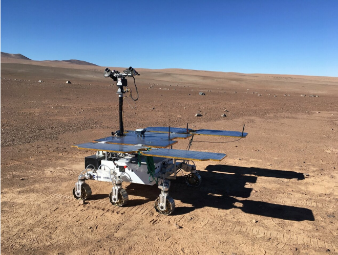
ExoFiT rover in Chile.

As it departed from the 'landing site' in a remote barren area, the first thing this prototype of ExoMars did was share a panoramic image and its location coordinates with mission control .