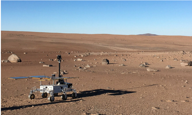
ExoFIT rover in Chile.

Rovers are versatile explorers on the surface of other planets, but they do need some training before setting off. A model of Rosalind Franklin rover that will be sent to Mars in 2021 is scouting the Atacama Desert, in Chile, following commands from mission control in the United Kingdom, over 11 000 km away.