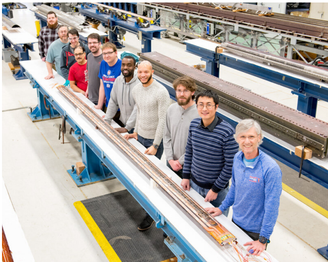
Fermilab engineers and technicians stand by a magnet coil made for the High-Luminosity LHC.

The U.S. Large Hadron Collider Accelerator Upgrade Project is the Fermilab-led collaboration of U.S. laboratories that, in partnership with CERN and a dozen other countries, is working to upgrade the Large Hadron Collider. LHC AUP began just over two years ago and, on Feb. 11, it received key approvals, allowing the project to transition into its next steps.