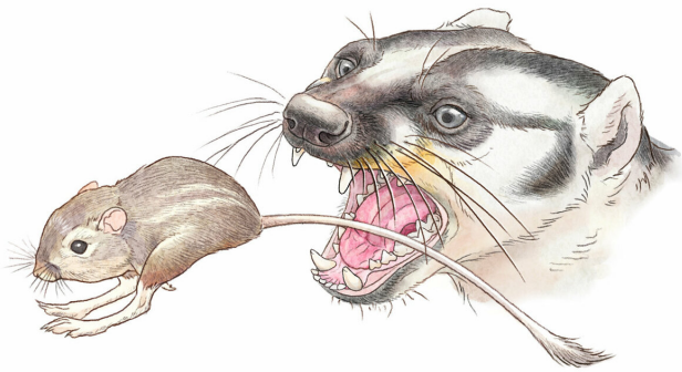
A reconstruction of the head of Leptarctus primus attacking the Miocene rodent Cupidininimus .

primarily a carnivore and an active predator, but that it could also have been an omnivore feeding on a wider range of plant and insect foods when necessary.