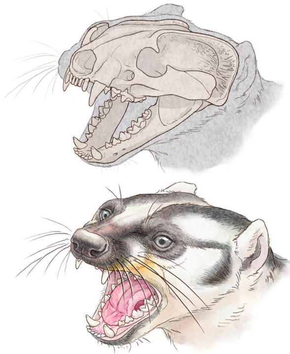
A reconstruction of the skull (upper) and head (lower) of Leptarctus primus , an extinct weasel relative that lived in North America and Asia about 20 million years ago.

New research on an extinct weasel relative reveals what it might have eaten when it lived in North America and Asia about 20 million years ago. The oddly shaped skull of Leptarctus primus has long led to conflicting theories about its diet. But the new work, based on biomechanical modeling and published this week in the Journal of Vertebrate Paleontology , shows that Leptarctus was likely a carnivorous predator, with capability for omnivory and a broader diet when prey was scarce, and had a skull that functioned similarly to that of the living