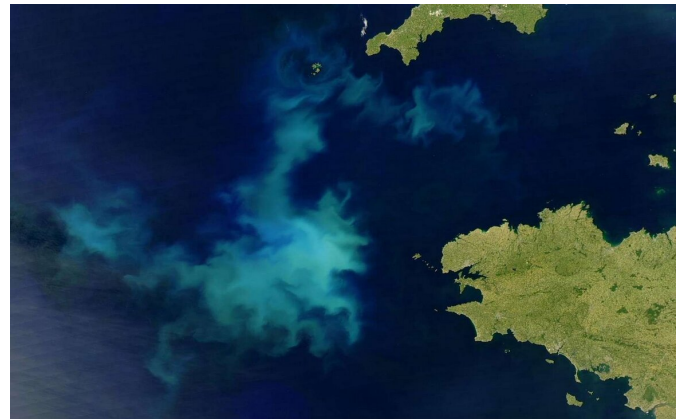
Bloom of coccolithophores visible from space.

Federico Zontone, scientists at the ESRF, in touch with the palaeontologists Luc Beaufort and Baptiste Suchéras-Marx and the marine biologist Ian Probert. The coherent X-ray diffraction imaging technique on ESRF beamline ID10 was used to generate incredibly detailed information on the 3-D structure (and therefore mass) of shells and individual coccoliths of several species of coccolithophore .