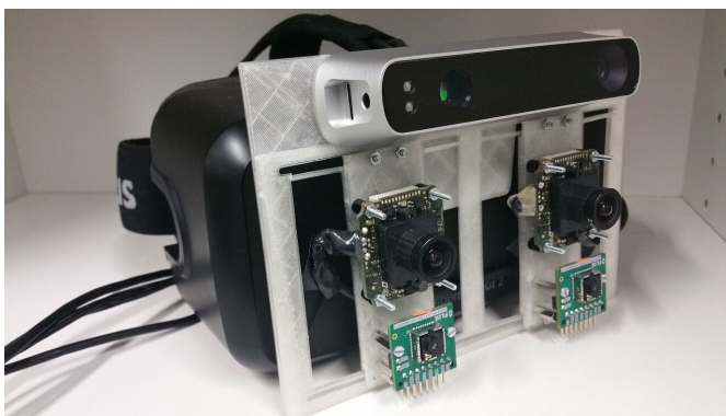
Scientists have developed a prototype infrared camera that is triggered when the wearer squints their eyes.

"Then when I look back to my computer in from of me, it could return to normal. All of this happens without me having to think much about it and it is this control we have been focusing on."