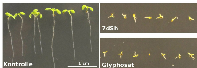
Arabidopsis thaliana seedlings after germination and 7-day growth: While the control group (left) developed normally, growth was inhibited by 260 \mu M glyphosate (figure below) or 7dSh (figure above). (scaling identical in all images)

Chemists and microbiologists at the University of Tübingen discovered an unusual antimetabolite with a simple chemical structure: a sugar molecule with the scientific name 7-deoxy-sedoheptulose (7dSh). Unlike ordinary carbohydrates, which usually serve as an energy source for growth, this substance inhibits the growth of plants and microorganisms, such as bacteria and yeasts. The sugar molecule blocks a key enzyme of the shikimate pathway, a metabolic pathway that occurs only in microorganisms and plants. For this reason, the scientists classify the substance as harmless for humans and animals, and have already demonstrated this in initial studies.