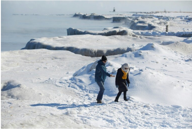
People walk along Lake Michigan's frozen shoreline as temperatures dropped to -20 degrees F (-29C) Chicago

Brutally cold temperatures gripped the US Midwest on Thursday, freezing water mains, causing power outages, canceling flights and straining natural gas supplies.