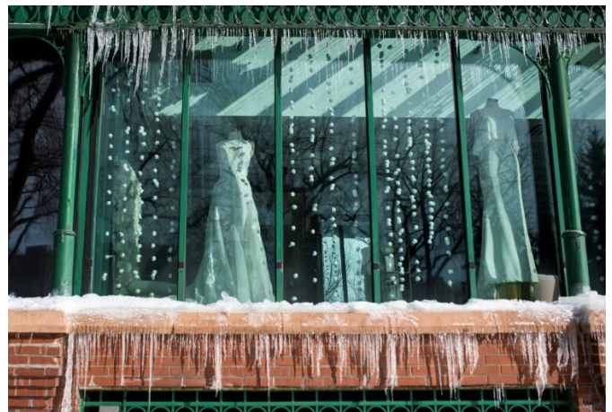
Icicles outside a bridal shop in Minneapolis, Minnesota

Rail service Amtrak planned to begin partially restoring service after canceling all lines Wednesday in and out of Chicago.