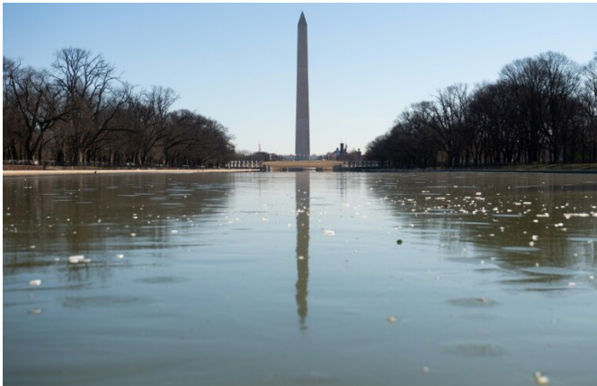
The Reflecting Pool on the National Mall in Washington is frozen as the region experiences frigid cold temperatures from a "polar vortex"

While officials warned residents to remain on guard as long as the sub-zero weather persisted, authorities in Michigan and Minnesota were also asking them to turn down their thermostats to conserve natural gas.