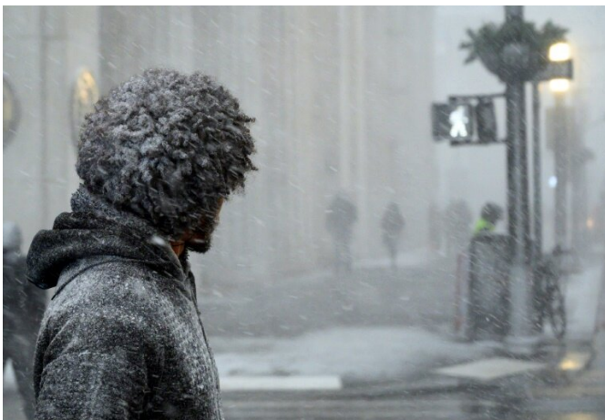
A man waits to cross a street in downtown Manhattan during a snow storm

The Arctic air mass that descended from its usual northern rotation on Wednesday caused the second coldest day ever recorded in the Windy City, where residents reported hearing "frost quakes."