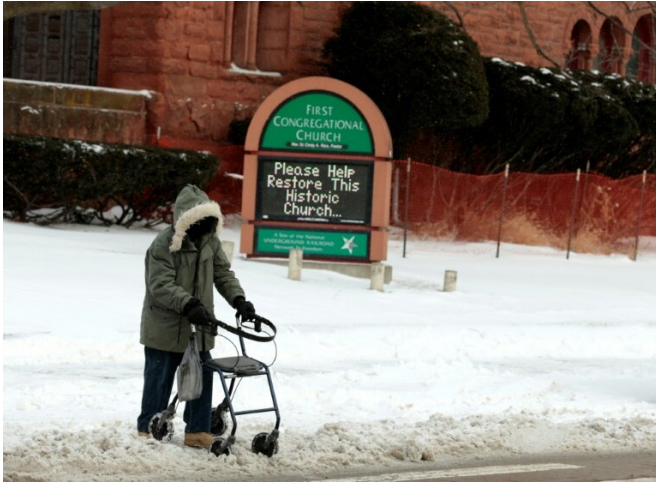
A person with a walker crosses Canfield Avenue in Detroit, Michigan

Frostbite warnings were issued for parts of the American Midwest on Wednesday as temperatures colder than Antarctica grounded flights, forced schools and businesses to close and disrupted life for tens of millions.