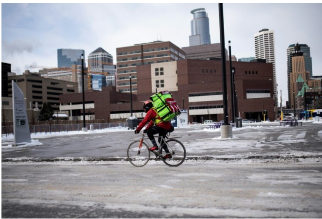
A bicyclist braves the cold in downtown Minneapolis, Minnesota

"Wind chill values of 30 to 60 degrees below zero will be common across the northern Plains, Great Lakes, and upper Midwest," it said. "If you can't stay cozy inside, be sure to cover any exposed skin."