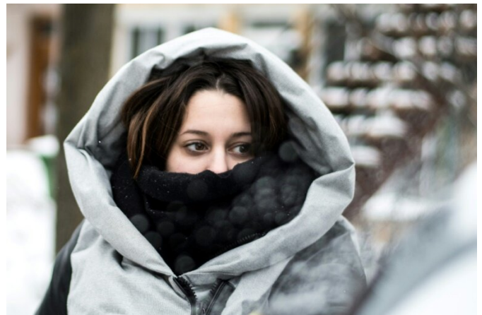
The arctic chill descended from Canada, where residents of Montreal were dealing with the severe winter cold—which even prompted a "hazardous" warning from

In Canada, the icy temperatures—stretching from Manitoba in the western Prairies region to the Atlantic seaboard—prompted a rare "hazardous" cold warning from the government.