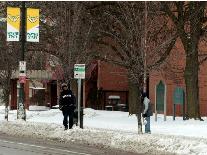
People wait for a bus in frosty Detroit, Michigan