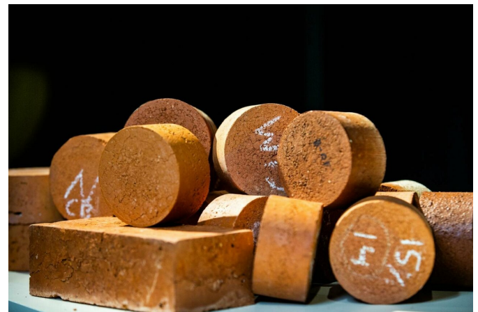
Fired-clay bricks incorporating biosolids.

Published this month in the journal Buildings , the research showed how making biosolids bricks only required around half the energy of conventional bricks.