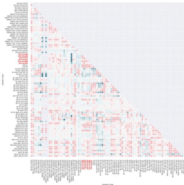
Figure 2: Correlation matrix for all features considered in

Forecasting using such networks typically don't perform as well as purely data-driven approaches presented above; nevertheless, they do aid in scenario analysis and policy analysis.