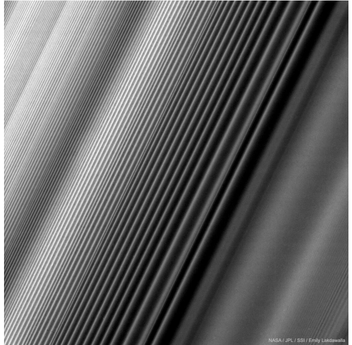
This Cassini image shows in unprecedented detail a density wave in Saturn's B ring, most likely caused by a small moon systematically perturbing the orbits of ring particles.

The rotation rate of 10:33:38 determined by Mankovich's analysis is several minutes faster than previous estimates based on radiometry from the Voyager and Cassini spacecraft.