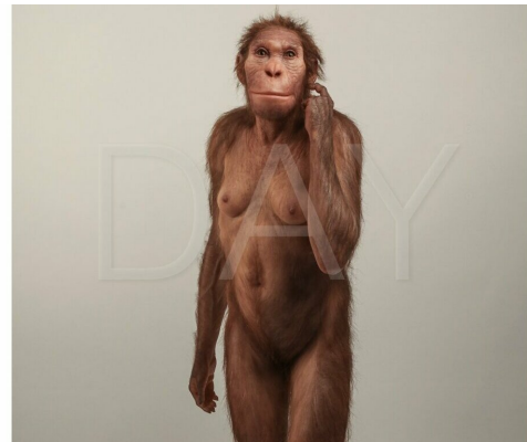
A life reconstruction of Au. sediba, commissioned by the University of Michigan's Museum of Natural History