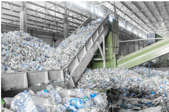
An escalator with a pile of plastic bottles at the factory for processing and recycling.

Why has the world continued to increase consumption of plastic materials when at the same time, environmental and human health concerns over their use have grown?