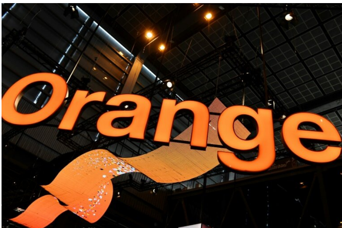
Orange won't use Huawei in France, but maybe elsewhere

The Czech cybersecurity agency said that Chinese laws "force private companies with their headquarters in China to cooperate with intelligence services", which could make them "a threat" if involved with a country's key technology.