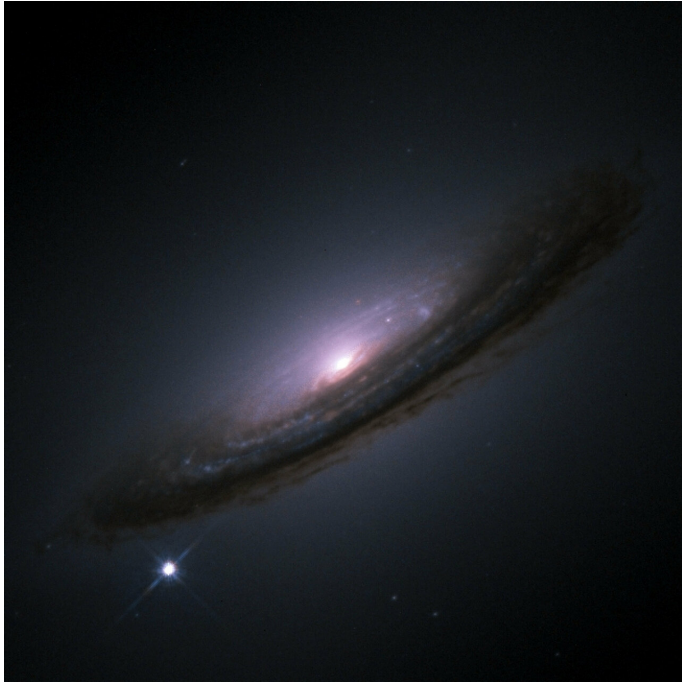
An image of SN 1994D (lower left), a Type Ia supernova detected in 1994 at the edge of galaxy NGC 4526 (center).

Type Ia supernovae have been used for cosmological studies because their consistent luminosity makes them ideal "cosmic lighthouses," according to Graham. They've been used to estimate the expansion rate of the universe and served as indirect evidence for the existence of dark energy.