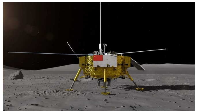
Artist's impression of the Chang'e-4 lander on the lunar surface.

These include the Lunar Lander Neutrons and Dosimetry (LND), which will be responsible for exploring the radiation environment in the vicinity of the lander; the Advanced Small Analyzer for Neutrals (ASAN), which will measure energy spectra of energetic neutral atoms originating from reflected solar wind ions; and the Netherlands-China Low-Frequency Explorer (NCLE) on the relay satellite Queqiao.