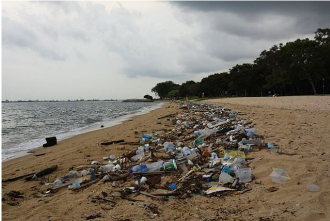
Litter on a beach in Singapore.

Last summer, I volunteered in Indonesia on the islands of Simeulue and Bangkaru. During this unique opportunity, I helped to monitor and protect the local green sea turtle population, and I witnessed firsthand the effects of waste on the environment. Despite Bangkaru's lack of human inhabitants—aside from the occasional small group of volunteers and two wildlife rangers—nearly all of its shores were bordered with large amounts of trash, primarily plastic .