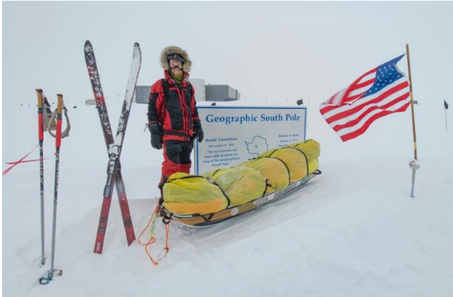
American adventurer Colin O'Brady poses for a photo at the Geographic South Pole sign in Antarctica

An American adventurer has become the first person to complete a solo trek across Antarctica without assistance of any kind.