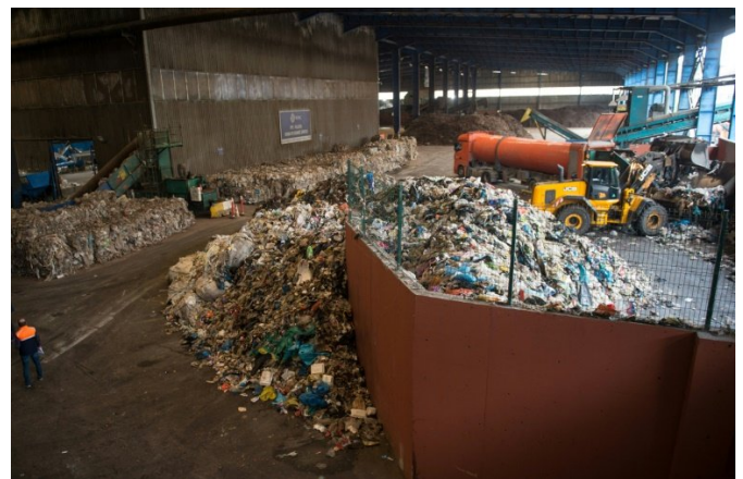
Turkey ranks 108th on the 2018 Environmental Performance Index, produced by the Yale Center for Environmental Law and Policy, of 180 nations

Turkey ranks 108th with a score of 52.96 in the 2018 Environmental Performance Index (EPI), produced by the Yale Center for Environmental Law and Policy, that analyses the environmental performance of 180 nations.