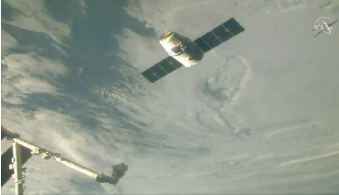
In this image taken from NASA Television, the SpaceX Dragon cargo spacecraft approaches the robotic arm for docking to the International Space Station, Saturday, Dec. 8, 2018. A communication drop-out has delayed a Christmas delivery at the International Space Station. (NASA TV via AP)