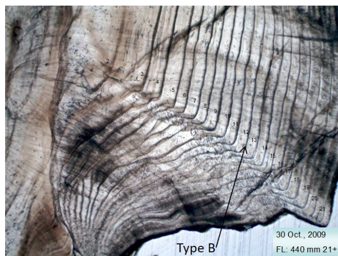
Otolith opaque zones of Type B (Black porgy).

The researchers analysed the features of the opaque zones in otoliths from a number of fish species. They used scanning electron microscopy to examine characteristics of the whole otolith, sections of the inner otolith structure, and the crystal structure of the otolith.