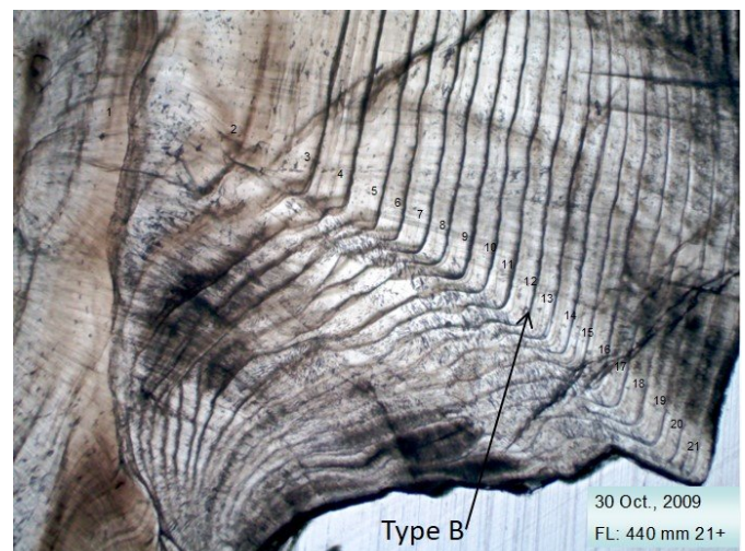
Otolith opaque zones of Type B (Black porgy).

The researchers analysed the features of the opaque zones in otoliths from a number of fish species. They used scanning electron microscopy to examine characteristics of the whole otolith, sections of the inner otolith structure, and the crystal structure of the otolith.