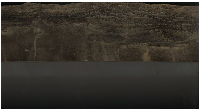
This roughly 1.5-foot slab of rock from southern China shows the Permian-Triassic boundary. The bottom section is pre-extinction limestone. The upper section is microbial limestone deposited after the extinction.