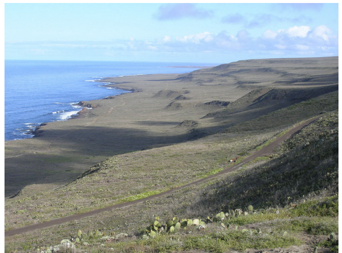
San Clemente Island, part of California's Channel Island archipelago, displays a stair-step landscape of uplifted marine terraces.

The study builds on research Castillo first presented in 2015, which suggested Catalina was sinking and tilting at a rate that could put the island completely underwater within 3 million years. Now, with the additional carbon-dated fossil evidence included in this paper, Klemperer said, the debate over Catalina's rise or fall should be settled. "We have absolute, 100 percent conviction that the island is currently going down."