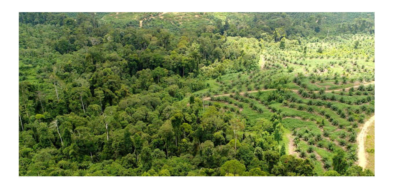
Palm oil plantation next to forest in Malaysia.

Certification – a mechanism by which consumers pay higher prices for more responsibly sourced products – is one way to help safeguard rainforests, and the wildlife which lives in them. Palm oil certification is spearheaded by the Roundtable on Sustainable Palm Oil (RSPO), who are leading the market toward environmentally and socially responsible palm oil that doesn't contribute to deforestation.