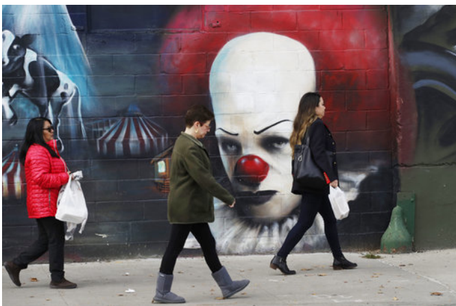
In this Wednesday, Nov. 7, 2018, photo, people walk past a mural in Long Island City in the Queens borough of New York. Across the East River from midtown Manhattan, Long Island City is a longtime industrial and transportation hub that has become a fast-growing neighborhood of riverfront high-rises and redeveloped warehouses, with an enduring industrial foothold and