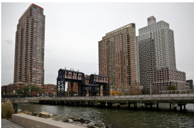
A former dock facility is shown with old transfer bridges, with "Long Island" painted in large letters at Gantry State Park in the Long Island City section of Queens Borough in New York, Tuesday, Nov. 13, 2018. Amazon announced Tuesday it has selected the Queens neighborhood as one of two sites for its headquarters.