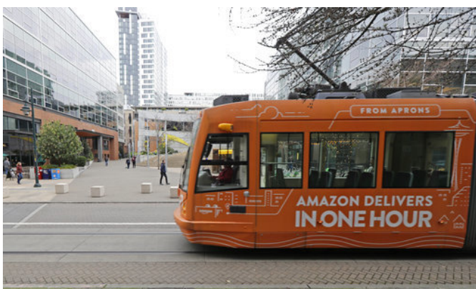
A South Lake Union streetcar with an advertisement for Amazon.com's same-day delivery service passes by an Amazon office building, Tuesday, Nov. 13, 2018, in Seattle's South Lake Union neighborhood. Amazon ended its competition for a second headquarters Tuesday by selecting New York and Arlington, Va., as the joint winners.

© 2018 The Associated Press. All rights reserved.