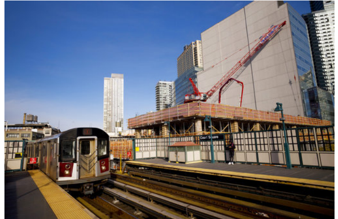
In this Wednesday, Nov. 7, 2018, photo, the Long Island City waterfront and skyline are shown in the Queens borough of New York. One of the areas that Amazon is considering for a headquarters is Long Island City. An old manufacturing area, it's cultivating a new image as a hub for 21st-century industry, creativity, and urbane living.