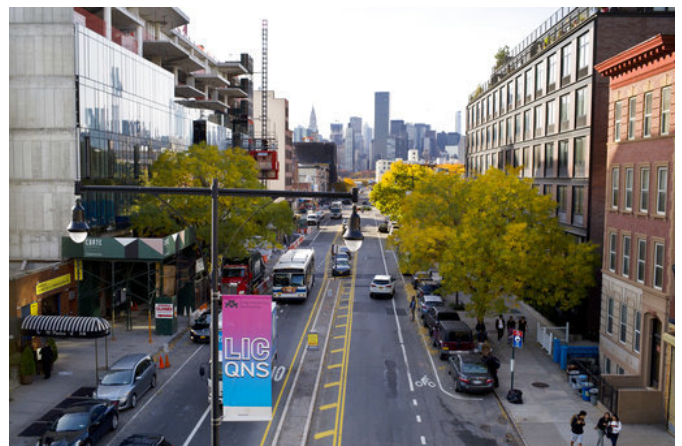
In this Wednesday, Nov. 7, 2018, photo, traffic moves along 44th Drive in Long Island City, Wednesday, Nov. 7, 2018, in the Queens borough of New York. Long Island City is a longtime industrial and transportation hub that has become a fast-growing neighborhood of riverfront high-rises and redeveloped warehouses, with an enduring industrial foothold and burgeoning arts and tech scenes.