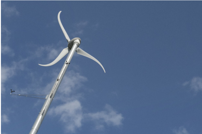
Wind turbine at the Sustainability Institute.

With energy demands rising, researchers at Penn State Behrend and the University of Tabriz, Iran, have completed an algorithm—or approach—to design more efficient wind farms, helping to generate more revenue for builders and more renewable energy for their customers.