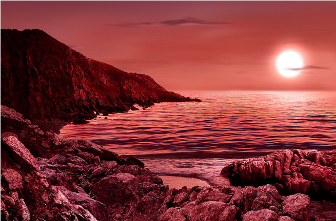
Artist's impression of how the surface of a potentially habitable planet orbiting a red dwarf star may appear.

When it comes to the search for extra-terrestrial life, scientists have a tendency to be a bit geocentric – i.e. they look for planets that resemble our own. This is understandable, seeing as how Earth is the only planet that we know of that supports life. As result, those searching for extra-terrestrial life have been looking for planets that are terrestrial (rocky) in nature, orbit within their stars habitable zones, and have enough water on their surfaces.