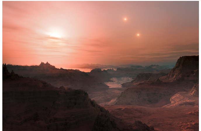
Artist's impression of a sunset seen from the surface of an Earth-like exoplanet.

"Too much landmass is a problem, as it restricts the amount of surface water, thereby making most of the continents very arid," said Lingam. "Arid ecosystems are typically characterized by low rates of biomass production on Earth. Instead, if one considers the opposite scenario (i.e. mostly oceans), one encounters a potential issue with the availability of phosphorus, which is one of the essential elements for life-as-we-know-it. Hence, this could result in a bottleneck on the amount of biomass."