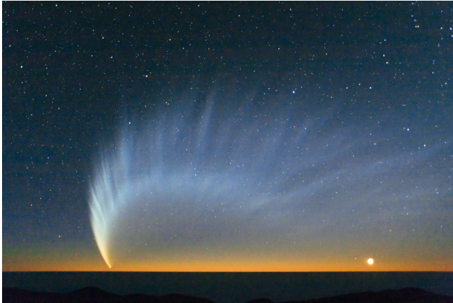
Comet McNaught over the Pacific Ocean. Image taken from Paranal Observatory in January 2007.

Engineers and scientists gathered around a screen in an operations room at the Naval Research Laboratory in Washington, D.C., eager to lay their eyes on the first data from NASA's STEREO spacecraft. It was January 2007, and the twin STEREO satellites—short for Solar and Terrestrial Relations Observatory—which had launched just months before, were opening their instruments' eyes for the first time. First up: STEREO-B. The screen blinked, but instead of the vast starfield they expected, a pearly white, feathery smear—like an angel's wing—filled the frame. For a few panicky minutes, NRL astrophysicist Karl Battams worried something was wrong with the telescope. Then, he realized this bright object wasn't a defect, but an apparition, and these were the first satellite images of Comet McNaught. Later that day, STEREO-A would return similar observations.