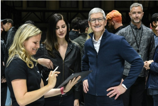
Apple CEO Tim Cook is seen during a launch event October 30 for a new iPad and Macbook Air

Apple on Thursday delivered stronger than expected profits in the recently ended quarter, but shares slid on disappointing iPhone sales and the forecast going into the year-end holiday.