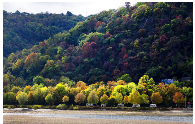
In this Wednesday, Oct.24, 2018 photo colorful trees are seen along the river Rhine near Bingen, Germany, during historically low water levels. A hot, dry summer has left German waterways at record low levels, causing chaos for the inland shipping industry, environmental damage and billions of euros of losses—a scenario that experts warn could portend things to come as global temperatures rise.

A family of beavers living in the German capital's central Tiergarten park has attracted a lot of