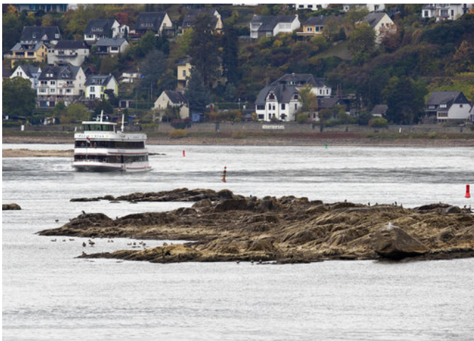
In this Wednesday, Oct.24, 2018 photo rocks look out of the river Rhine near Oberwesel, Germany, during historically low water levels. A hot, dry summer has left German waterways at record low levels, causing chaos for the inland shipping industry, environmental damage and billions of euros of losses—a scenario that experts warn could portend things to come as global temperatures rise.