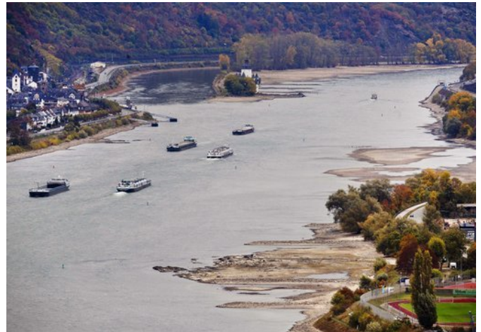
In this Wednesday, Oct.24, 2018 picture cargo ships pass sandbanks in the river Rhine near Oberwesel, Germany, during historically low water levels. A hot, dry summer has left German waterways at record low levels, causing chaos for the inland shipping industry, environmental damage and billions of euros of losses—a scenario that experts warn could portend things to come as global temperatures rise.