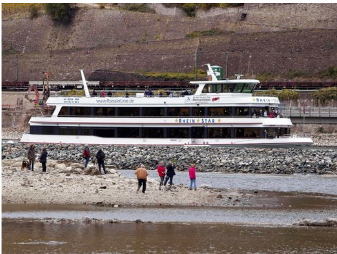
In this Wednesday, Oct.24, 2018 photo people stand on sandbank in the river Rhine near Bingen, Germany, during historically low water levels. A hot, dry summer has left German waterways at record low levels, causing chaos for the inland shipping industry, environmental damage and billions of euros of losses—a scenario that experts warn could portend things to come as global temperatures rise.

"It's flowing backward, so to speak," he said.