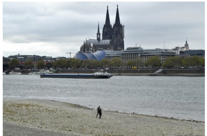
In this Oct. 22, 2018 photo a ship on the Rhine River passes the cathedral in Cologne, Germany, during historically low water levels. A hot, dry summer has left German waterways at record low levels, causing chaos for the inland shipping industry, environmental damage and billions of euros of losses—a scenario that experts warn could portend things to come as global temperatures rise.

Causes for the die-offs include greater concentrations of pesticides and other toxins due to the lower volume of water, boat traffic riding closer to the riverbeds, the increased number of boats on the rivers and less oxygen in the water, Wessel said.