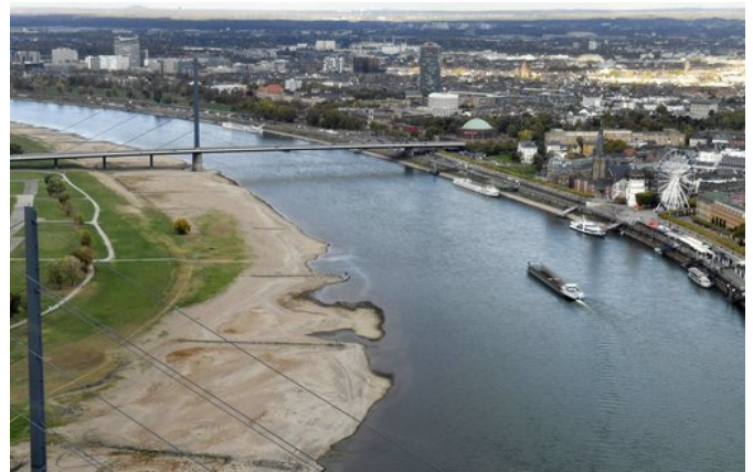
In this Oct. 22, 2018 photo a cargo ship drives on the Rhine River in Duesseldorf, Germany, during historically low water levels. A hot, dry summer has left German waterways at record low levels, causing chaos for the inland shipping industry, environmental damage and billions of euros of losses—a scenario that experts warn could portend things to come as global temperatures rise.