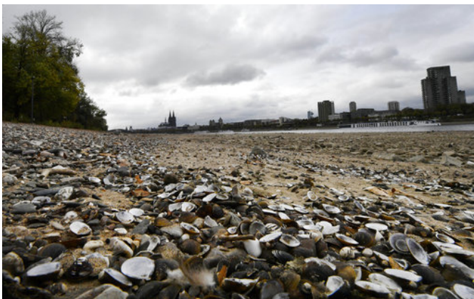
In this Oct. 22, 2018 photo mussels sit on the bank of the Rhine River in Cologne, Germany, during historically low water levels of only 70 centimeters. A hot, dry summer has left German waterways at record low levels, causing chaos for the inland shipping industry, environmental damage and billions of euros of losses—a scenario that experts warn could portend things to come as global temperatures rise.