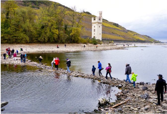
In this Wednesday, Oct.24, 2018 picture people walk over stones looking out of the river Rhine to the Maeuseturm (mice tower) of Bingen, Germany, which usually sits on an island. A hot, dry summer has left German waterways at record low levels, causing chaos for the inland shipping industry, environmental damage and billions of euros of losses—a scenario that experts warn could portend things to come as global temperatures rise.