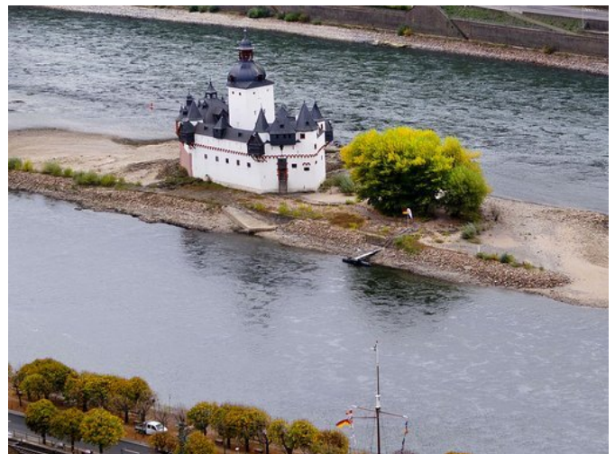
In this Wednesday, Oct.24, 2018 photo the Pfalzgrafenstein castle from the 14th century sits on a sandbank in the river Rhine in Kaub, Germany, during historically low water levels. A hot, dry summer has left German waterways at record low levels, causing chaos for the inland shipping industry, environmental damage and billions of euros of losses—a scenario that experts warn could portend things to come as global temperatures rise.