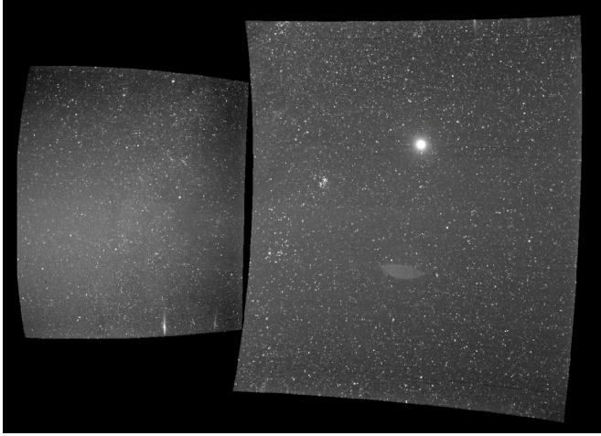
The view from Parker Solar Probe's WISPR instrument on Sept. 25, 2018, shows Earth, the bright sphere near the middle of the right-hand panel. The elongated mark toward the bottom of the panel is a lens reflection from the WISPR instrument.

On Sept. 25, 2018, Parker Solar Probe captured a view of Earth as it sped toward the first Venus gravity assist of the mission. Earth is the bright, round object visible in the right side of the image.