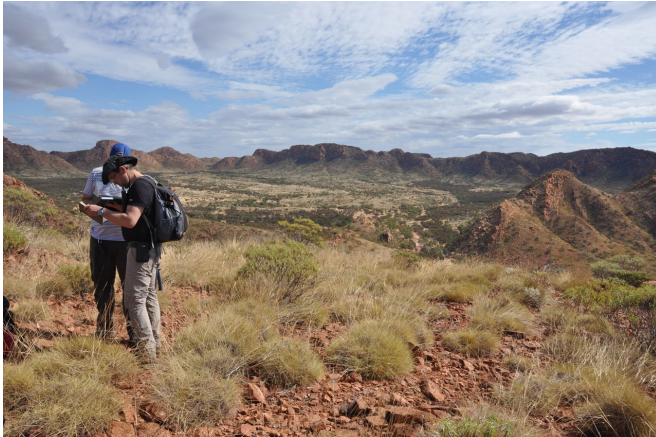
Scientists working at the central peak of Gosses Bluff meteorite crater in Northern Territory.