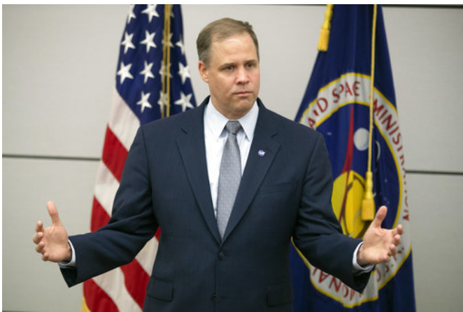
Administrator of the National Aeronautics and Space Administration (NASA) Jim Bridenstine speaks during a news conference at the U.S. embassy in Moscow, Russia, Friday, Oct. 12, 2018.

About 34 minutes elapsed from the time the rocket failed to when the capsule finally parachuted to a landing on the steppes of Kazakhstan, where rescue crews swiftly picked up the pair.