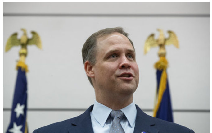
Administrator of the National Aeronautics and Space Administration (NASA) Jim Bridenstine speaks during a news conference at the U.S. embassy in Moscow, Russia, Friday, Oct. 12, 2018.

Sergei Krikalyov, the head of Roscosmos' manned programs, said the launch went awry after one of the rocket's four boosters failed to jettison about two minutes into the flight, damaging the main stage and triggering the emergency.