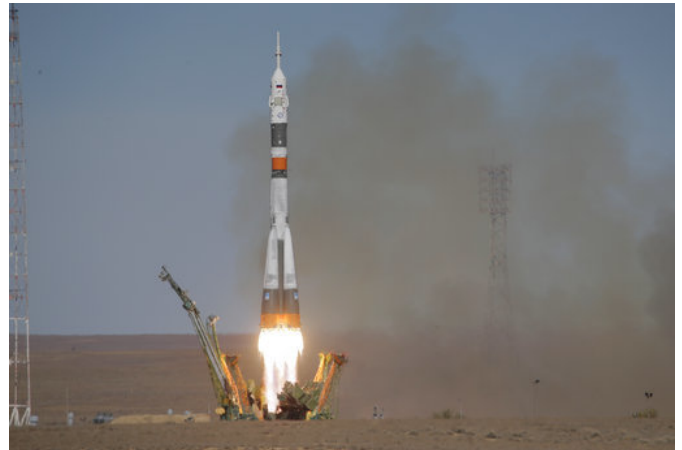
The Soyuz-FG rocket booster with Soyuz MS-10 space ship carrying a new crew to the International Space Station, ISS, blasts off at the Russian leased Baikonur cosmodrome, Kazakhstan, Thursday, Oct. 11, 2018. Two astronauts from the U.S. and Russia are making an emergency landing after a Russian booster rocket carrying them into orbit to the International Space Station has failed after launch.

"We're getting really close already," Bridenstine said. "We are anxiously anticipating early next year the test of two separate commercial crew vehicles that will fly to the International Space Station—SpaceX and Boeing."