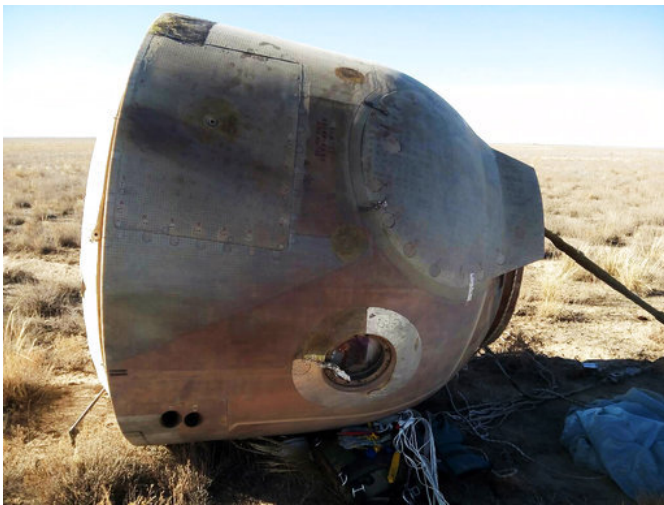
In this photo provided by Russian Defense Ministry Press Service, the Soyuz MS-10 space capsule lays in a field after an emergency landing near Dzhezkazgan, about 450 kilometers (280 miles) northeast of Baikonur, Kazakhstan, Thursday, Oct. 11, 2018. NASA astronaut Nick Hague and Roscosmos' Alexei Ovchinin lifted off as scheduled at 2:40 p.m. (0840 GMT; 4:40 a.m. EDT) Thursday from the Russian-leased Baikonur cosmodrome in Kazakhstan, but their Soyuz booster rocket failed about two minutes after the launch.

The current space station crew of an American, a Russian and a German was scheduled to return to Earth in December after a six-month mission. A Soyuz capsule attached to the station that they use to ride back to Earth is designed for 200 days in space, meaning that their stay in orbit could only be extended briefly.