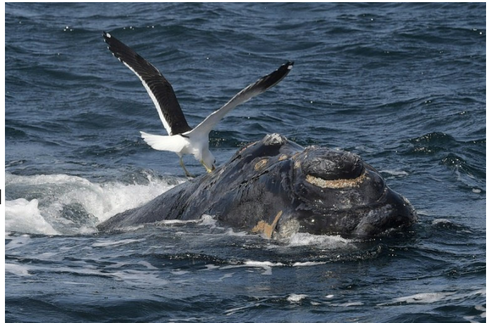
The International Whale Commission's "Florianopolis Declaration" sees whaling as no longer being a necessary economic activity