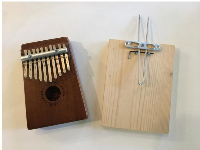
Mbira instrument next to a density sensor based on it.

published today in ACS Omega , can accurately measure the density of any liquid. Comparing the density of a suspicious liquid medicine to the density of the known product can reveal whether or not the two medicines have the same ingredients.