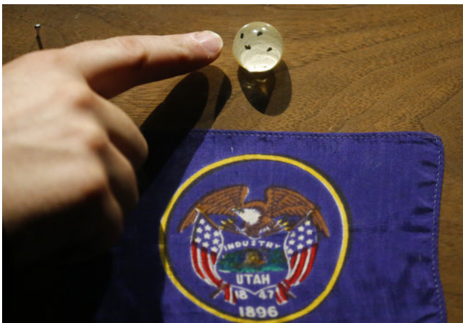
In this Wednesday, Aug. 22, 2018, photo, shows moon rocks encased in acrylic at the Clark Planetarium, in Salt