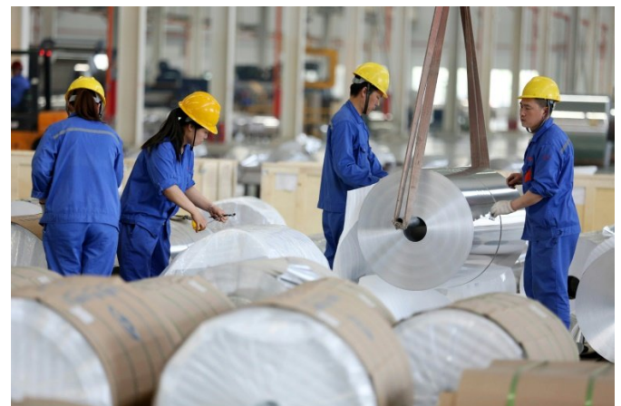
Beijing is worried by a growing list of foreign and Chinese firms moving production and factories abroad

"Building a factory abroad allows 'indirect growth,' by evading international trade barriers."