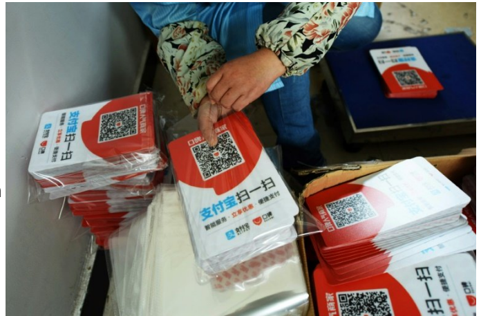
Alibaba transformed how Chinese people shop and pay for goods

It transformed how Chinese people shop and pay for things, especially through the now ubiquitous Alipay digital payment service.