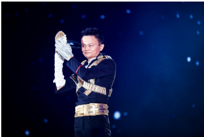
Jack Ma, chairman of Alibaba group, has told the New York Times he plans to retire on Monday

Alibaba's charismatic co-founder and chairman Jack Ma plans to retire from the Chinese e-commerce giant on Monday to devote his time to philanthropy focused on education, he told the New York Times in an interview.