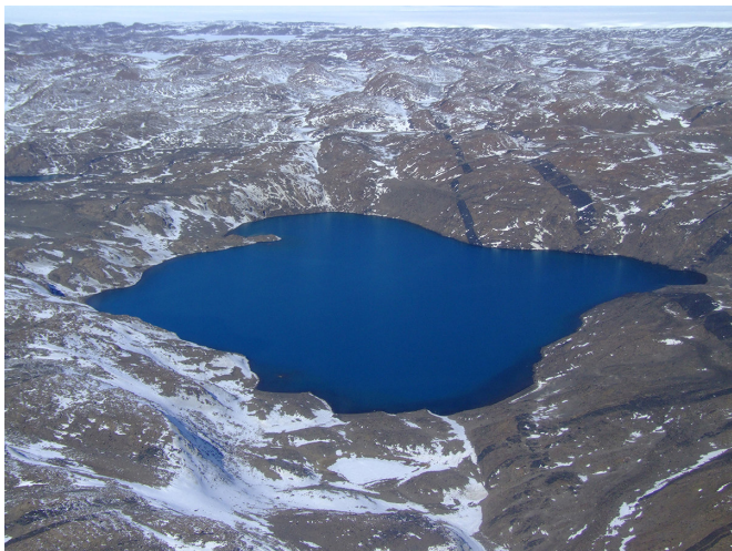
Antarctica's Deep Lake.