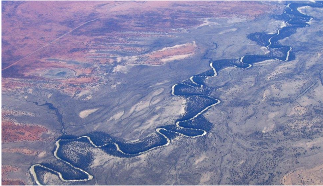
The Darling River near Menindee.

Gooraman Swamp is dry. The leaves of the stately River Red Gums that dot the area are parched and limp.