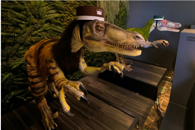
Dinosaur robots wait to check in customers at the Henn na hotel

The reception at the Henn na Hotel east of Tokyo is eerily quiet until customers approach the robot dinosaurs manning the front desk. Their sensors detect the motion and they bellow "Welcome."